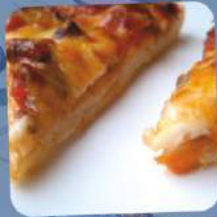
CHEESE AND TOMATO PIZZA