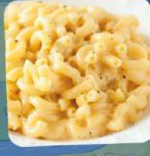
MACARONI CHEESE (V)